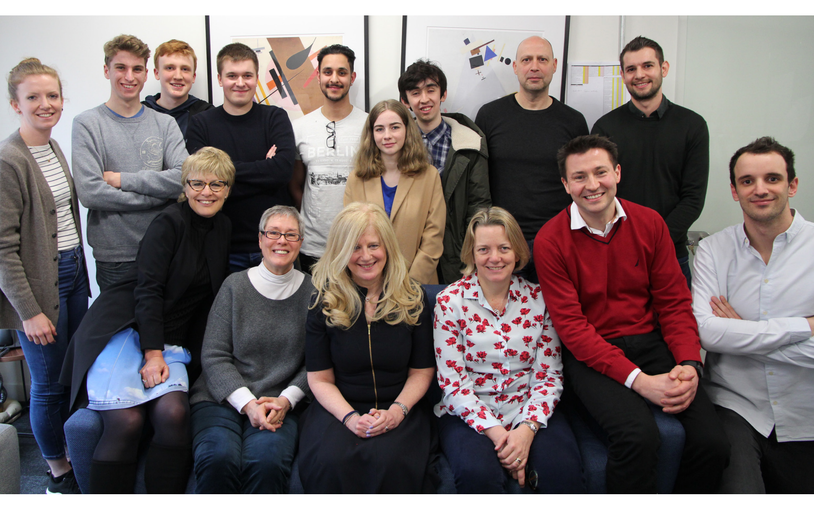
ASC Staff, Trustees and some of the members of the ASC Youth Panel

"The ASC Youth Panel is now 3 years old, and it's great to see it's still going strong. Since our successful website launch last year, we've continued to work on our Youth Ambassador scheme and are excited to finally start work on our new Stamback in Time project. It's always great to meet other young people who stammer, and look at ways that as a panel we can help more young people who stammer like us".